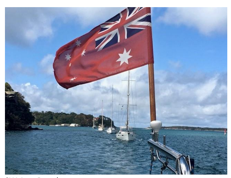
SW Arm Parade

Heavy rain pelted down from around 0300 on Saturday, so we were pleasantly surprised to see six more boats arriving from Sydney Harbour, after enduring wild conditions – Cap Norte, Windflyt, Akiiki, Allegro, Mercier and Ariki Tai.