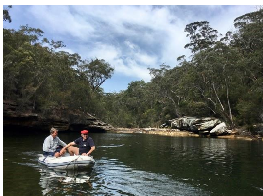
Anice Falls, SW Arm