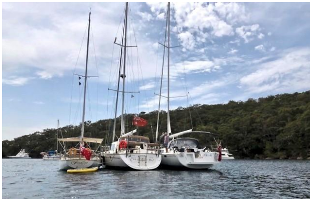
Nautilee, Allegro, Mercier, Cap Norte