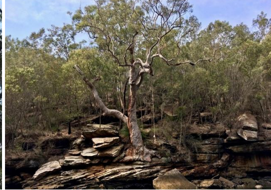
A beautiful Bird of Prey Gorgeous Angophora