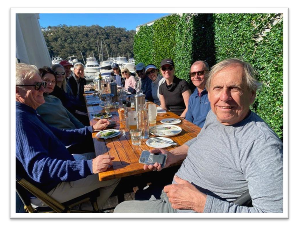
Lunch at Echo Point

Harbour. Boats attending were Zeus, Free Spirit and Sweet Chariot from the Squadron and Wilde Rush, Ariki Tai and Reve from CYC.